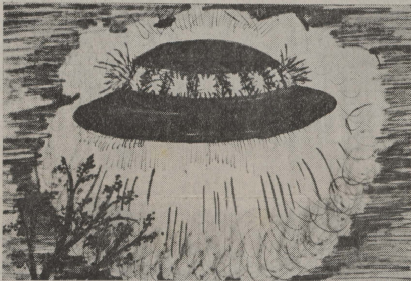
FLYING SAUCER: Impression of the invaders on Eagle's Crag